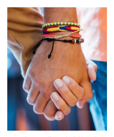
Switzer Fellows hold hands during an activity at the 2023 Fall Retreat.